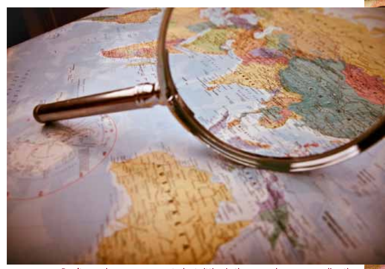
Don't spend your years as a student sitting in the same classroom reading the same textbooks. Whether you want to learn, teach, work or explore, India is waiting for you.